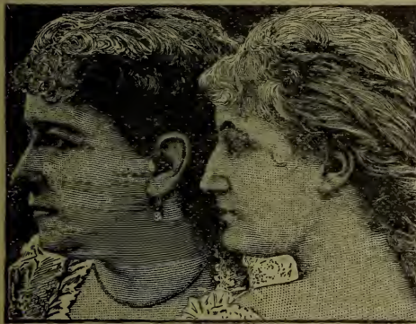
LIKE FATHER OR MOTHER?